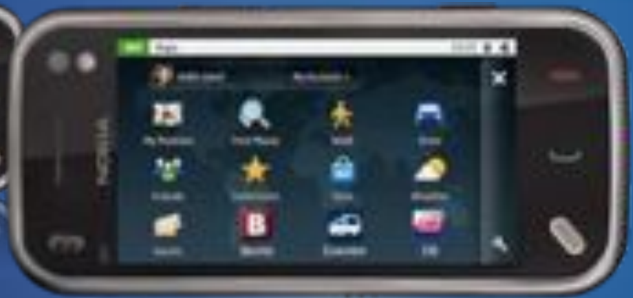
Ovi Services Ecosystem