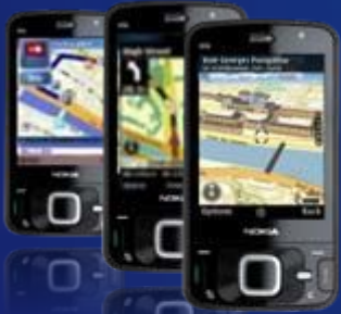
Nokia Maps Application