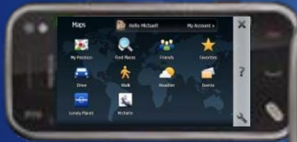
Ovi Maps Services